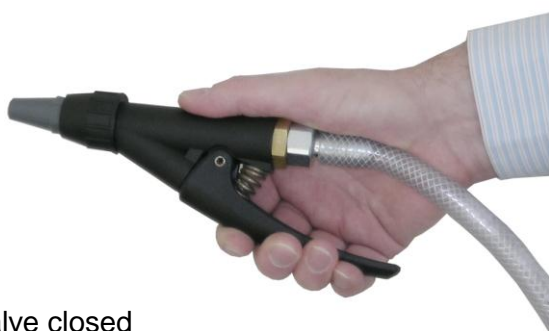
Valve closed (no air flow)

There are two alternatives for manual pick up