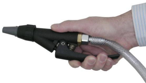
Valve open (air flows)