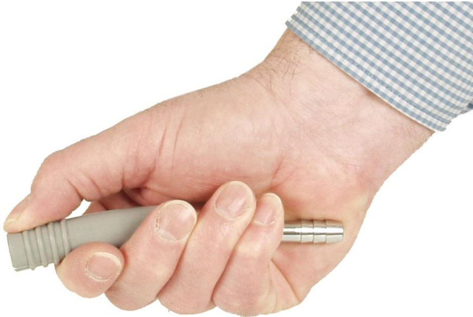
Valve open (air flows small)